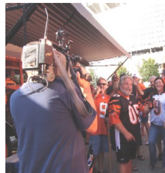
Buck mugs for a channel 9 TV camera