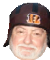
Bill Bengals:27 Browns:23